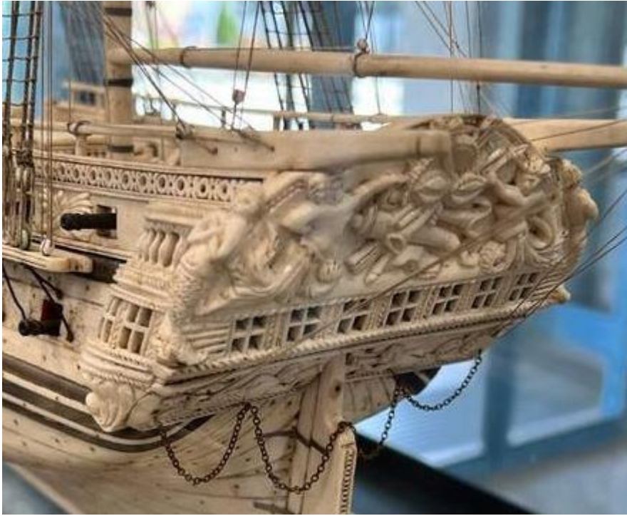
Excellent stern board carved decoration