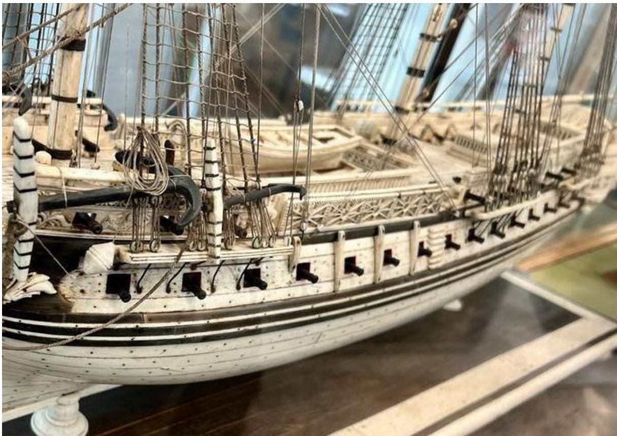
Port side gun deck, baleen gun wales, hammock nettings

A fine Prisoner-of-War Bone Model of a Fifth Rate Ship-of-the Line (48 guns), English, early 19th century, the pinned and planked hull with horn strakes, three masts with standing and running rigging. English shaped stern with excellent stern board carved decoration, carved warrior figurehead. Two anchors on port and starboard side.