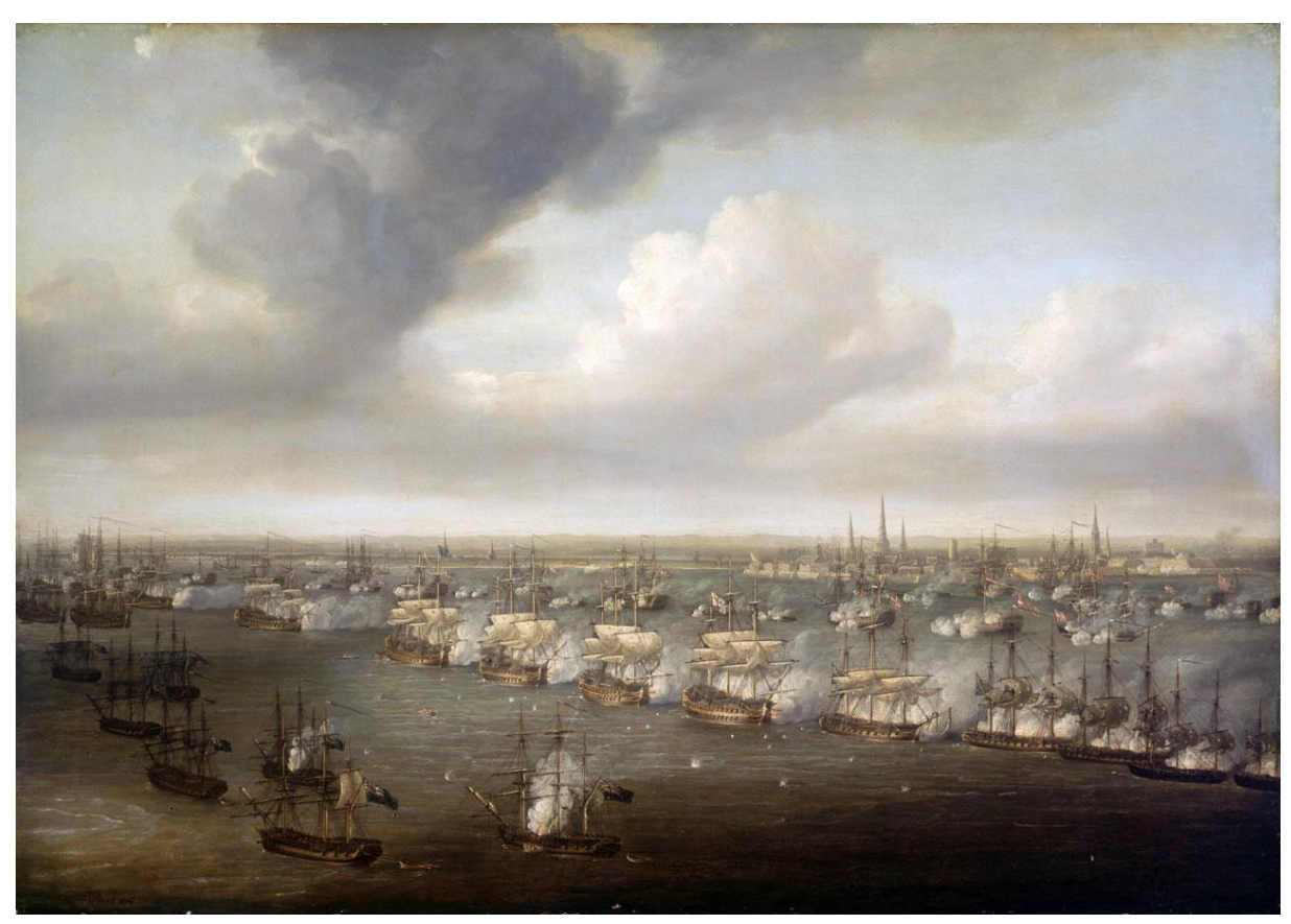
Nicholas_Pocock - The_Battle of Copenhagen, 2 April 1801

The bomb vessels are shown in the lower left corner of the painting. The mortars fire over the English and Danish lines to destroy Copenhagen.