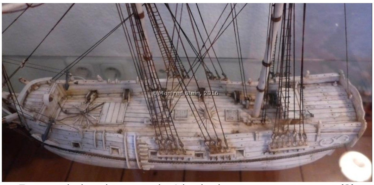
Forecastle hatch secured with planks to cover a mortar (?)