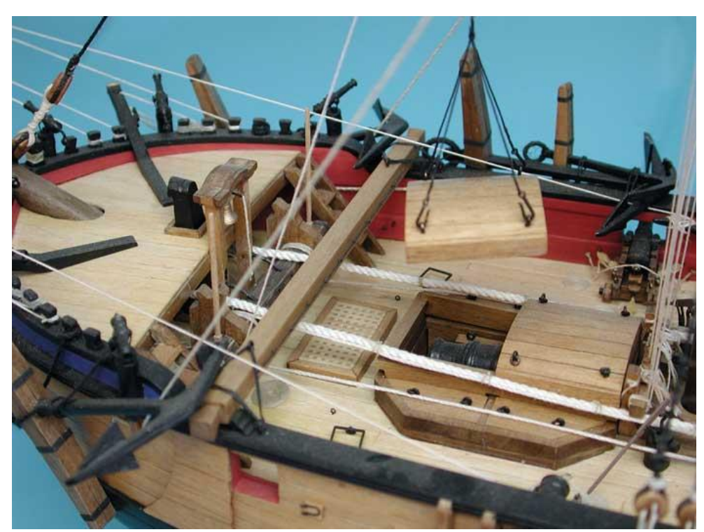
Wood model<sup>5</sup> of HM bomb ketch GRANADO lifting the planks of the front mortar