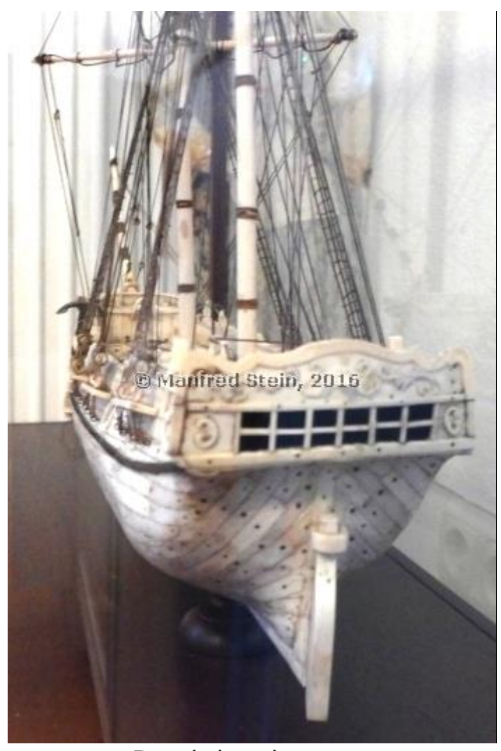
Bomb ketch, stern