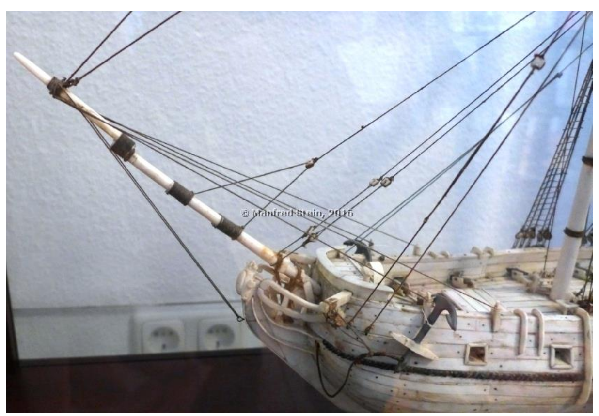
Bomb ketch, bowsprit gear