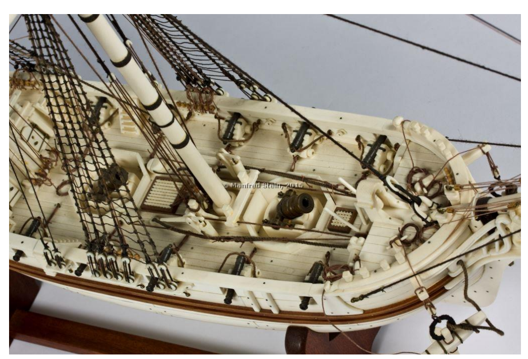
HM bomb ketch GRANADO with two mortars

Ivory model of bomb ketch HMS GRANADO <sup>3</sup> in the International Maritime Museum, Hamburg<sup>4</sup>: