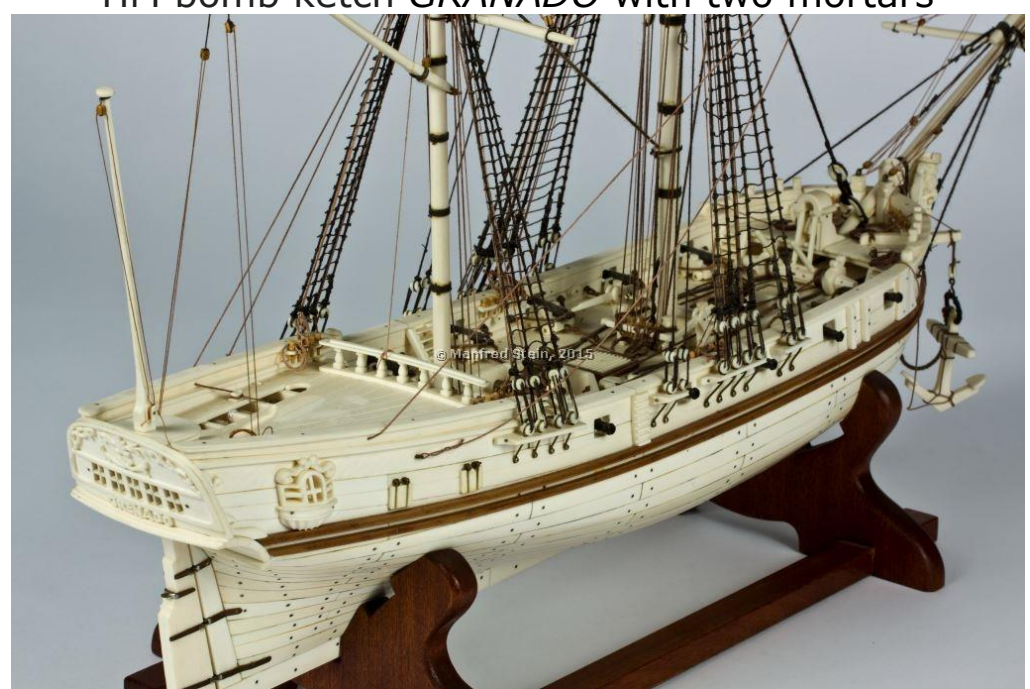
HM bomb ketch GRANADO no spanker